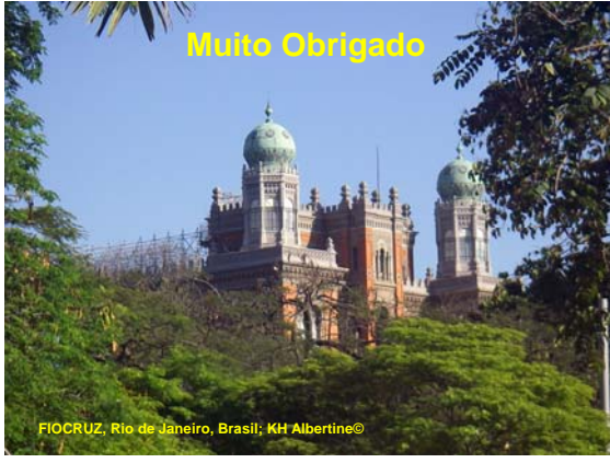
FIOCRUZ, Rio de Janeiro, Brasil